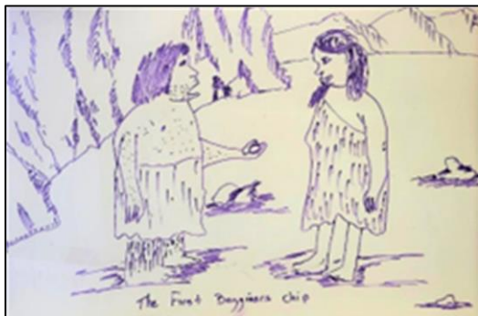
The First Beginners Chip