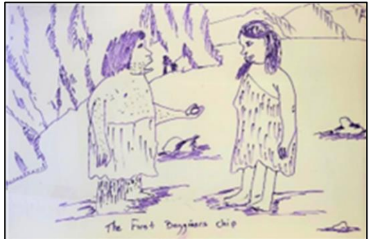
The First Beginners Chip